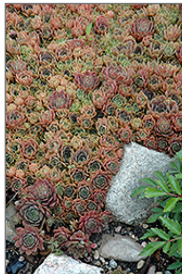
Silverine Hens And Chicks