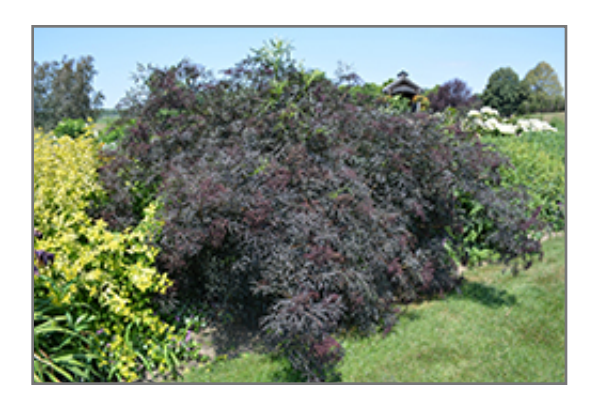
Black Lace Flder