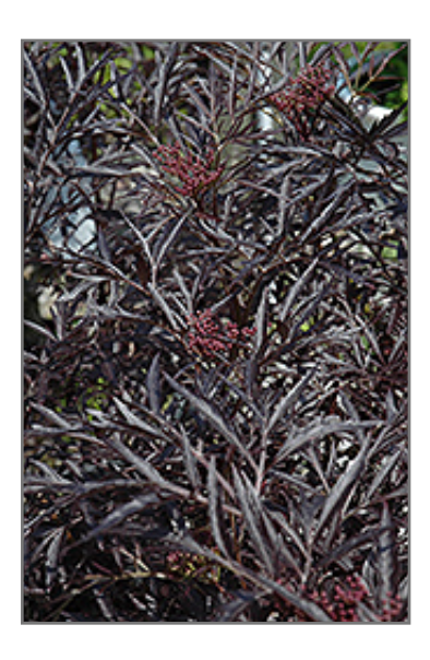
Black Lace Elder flowers

This shrub does best in full sun to partial shade. It is quite adaptable, prefering to grow in average to wet conditions, and will even tolerate some standing water. It is not particular as to soil type or pH. It is highly tolerant of urban pollution and will even thrive in inner city environments. This is a selected variety of a species not originally from North America.