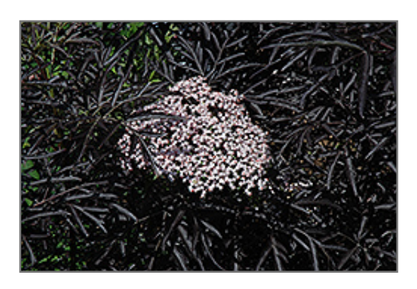
Black Lace Elder flowers