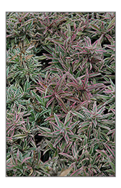
Variegated Creeping Phlox foliage

Variegated Creeping Phlox has masses of beautiful lightly-scented violet star-shaped flowers at the ends of the stems from early to late spring, which are most effective when planted in groupings. Its attractive tiny narrow leaves are green in colour with showy white variegation. As an added bonus, the foliage turns a gorgeous pink in the fall.