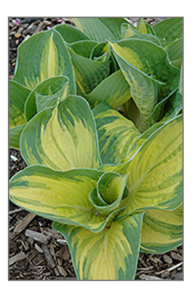
Great Expectations Hosta foliage

A beautiful variety featuring neat mounds of large, blue-green foliage with chartreuse centers and margins; pale lavender flowers appear on tall scapes during the summer months; adds texture, color and contrast to shaded beds, borders and containers