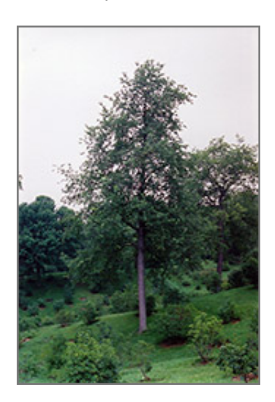
Black Cherry