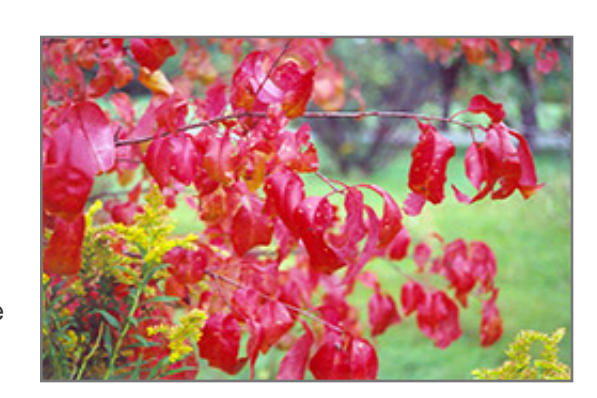
Black Cherry in fall