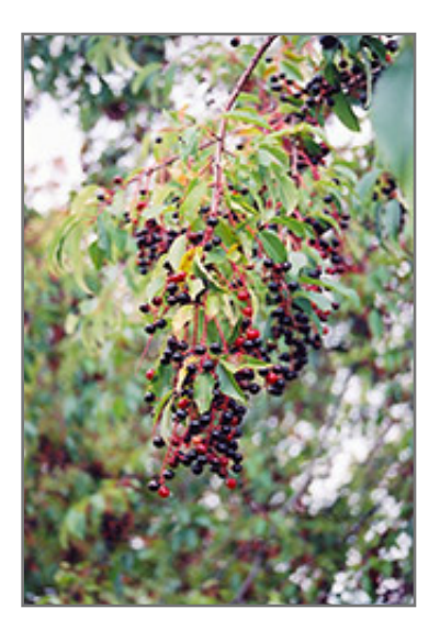
Black Cherry fruit

Black Cherry is a deciduous tree with a shapely oval form. Its average texture blends into the landscape, but can be balanced by one or two finer or coarser trees or shrubs for an effective composition.