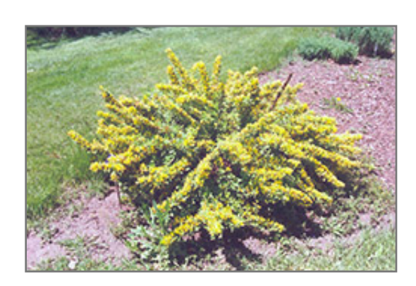
Shrub Broom in bloom

Better known in European gardens than in North America, this compact shrub deserves to be more used here; this rounded shrub has spikes of radiant golden flowers protruding from the branches in late summer when few other shrubs are in bloom