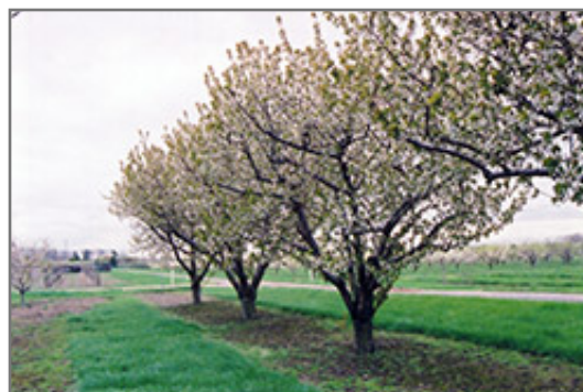
Sweet Cherry in bloom