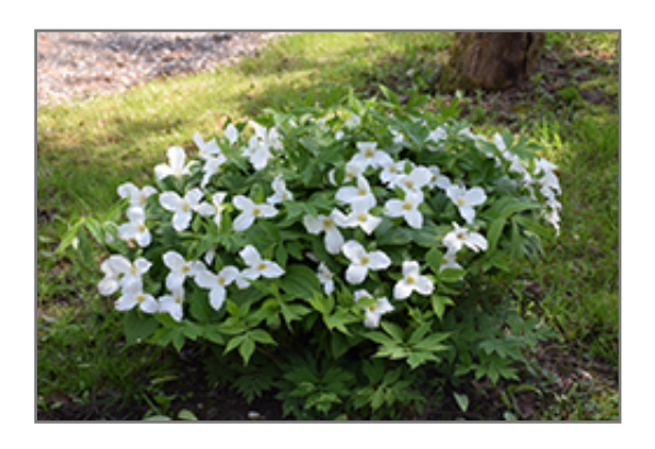
Great White Trillium in bloom