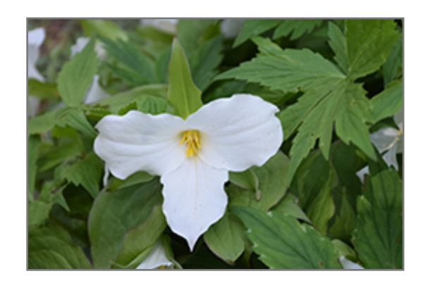
Great White Trillium flowers