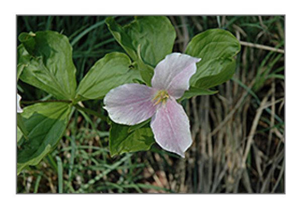
Great White Trillium flowers (faded)

Great White Trillium will grow to be about 8 inches tall at maturity extending to 12 inches tall with the flowers, with a spread of 12 inches. When grown in masses or used as a bedding plant, individual plants should be spaced approximately 10 inches apart. Its foliage tends to remain low and dense right to the ground. It grows at a slow rate, and under ideal conditions can be expected to live for approximately 10 years. As an herbaceous perennial, this plant will usually die back to the crown each winter, and will regrow from the base each spring. Be careful not to disturb the crown in late winter when it may not be readily seen! As this plant tends to go dormant in summer, it is best interplanted with late-season bloomers to hide the dying foliage.