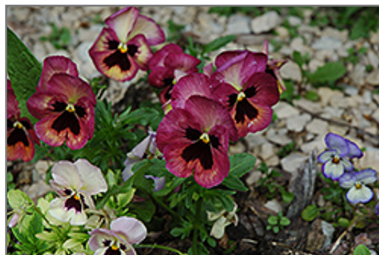
Jim's Garden Purple Pansy flowers