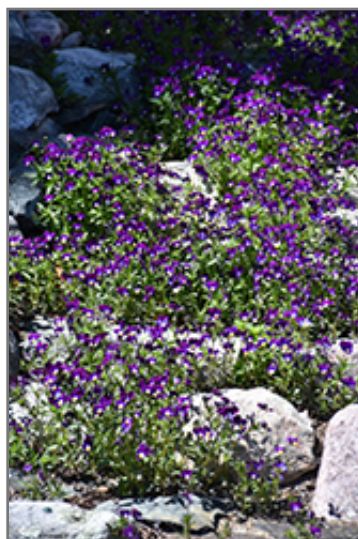
Johnny Jump-Up in bloom