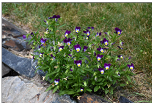
Johnny Jump-Up in bloom

Johnny Jump-Up will grow to be only 4 inches tall at maturity extending to 6 inches tall with the flowers, with a spread of 6 inches. When grown in masses or used as a bedding plant, individual plants should be spaced approximately 5 inches apart. It grows at a fast rate, and tends to be biennial, meaning that it puts on vegetative growth the first year, flowers the second, and then dies. However, this species tends to self-seed and will thereby endure for years in the garden if allowed. As an herbaceous perennial, this plant will usually die back to the crown each winter, and will regrow from the base each spring. Be careful not to disturb the crown in late winter when it may not be readily seen!