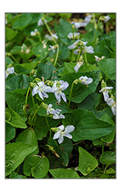
Freckles Violet flowers

Freckles Violet features delicate white flowers with blue spots at the ends of the stems from early spring to mid summer. Its tomentose heart-shaped leaves remain green in colour throughout the season. The brick red stems are very colorful and add to the overall interest of the plant.