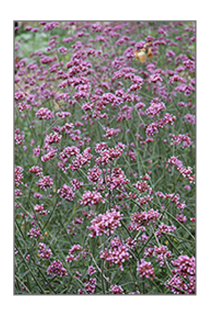
Tall Verbena flowers