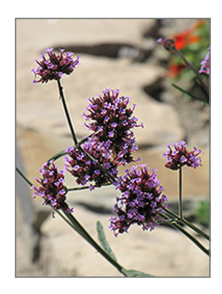
Tall Verbena flowers