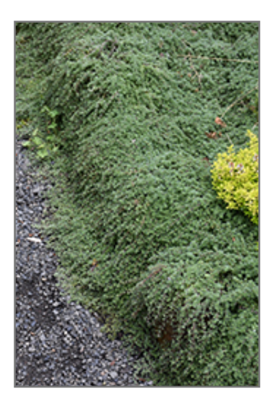
Wooly Thyme