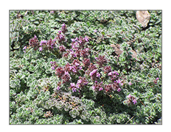
Wooly Thyme flowers