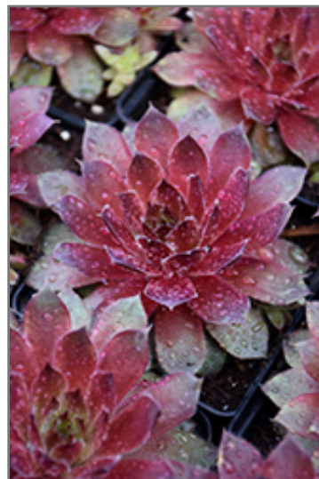
More Honey Hens And Chicks