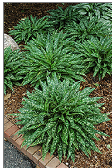
Raspberry Splash Lungwort