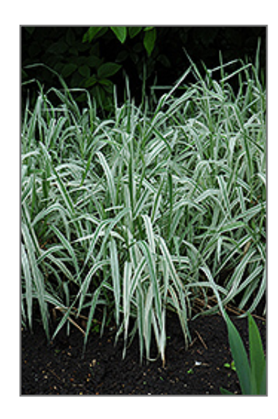
Variegated Ribbon Grass foliage

Variegated Ribbon Grass will grow to be about 32 inches tall at maturity, with a spread of 3 feet. It grows at a fast rate, and under ideal conditions can be expected to live for approximately 20 years. As an herbaceous perennial, this plant will usually die back to the crown each winter, and will regrow from the base each spring. Be careful not to disturb the crown in late winter when it may not be readily seen!