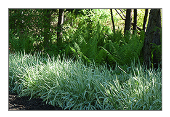
Variegated Ribbon Grass foliage