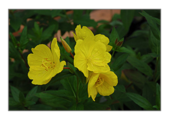
Yellow Sundrops flowers