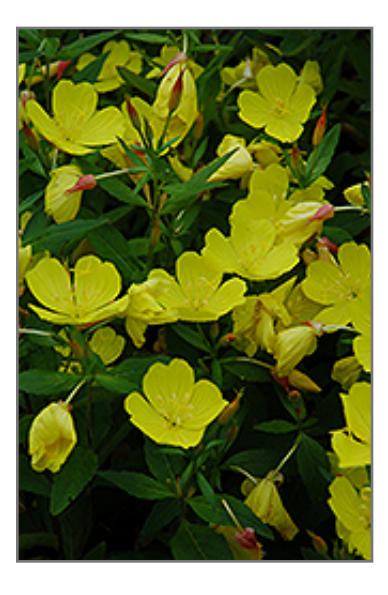
Yellow Sundrops flowers