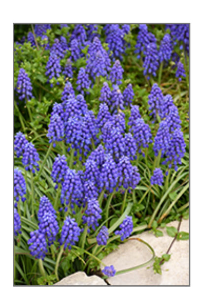
Grape Hyacinth flowers

Grape Hyacinth will grow to be only 4 inches tall at maturity extending to 8 inches tall with the flowers, with a spread of 4 inches. It grows at a medium rate, and under ideal conditions can be expected to live for approximately 5 years. As an herbaceous perennial, this plant will usually die back to the crown each winter, and will regrow from the base each spring. Be careful not to disturb the crown in late winter when it may not be readily seen! As this plant tends to go dormant in summer, it is best interplanted with late-season bloomers to hide the dying foliage.