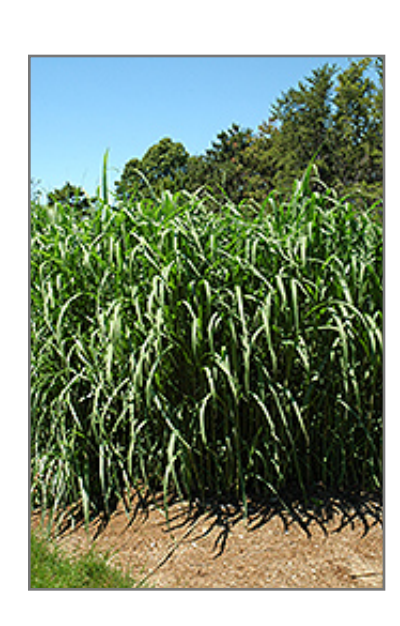
Giant Silver Grass

Giant Silver Grass will grow to be about 7 feet tall at maturity, with a spread of 4 feet. It tends to be leggy, with a typical clearance of 1 foot from the ground, and should be underplanted with lower-growing perennials. It grows at a medium rate, and under ideal conditions can be expected to live for approximately 20 years. As an herbaceous perennial, this plant will usually die back to the crown each winter, and will regrow from the base each spring. Be careful not to disturb the crown in late winter when it may not be readily seen!