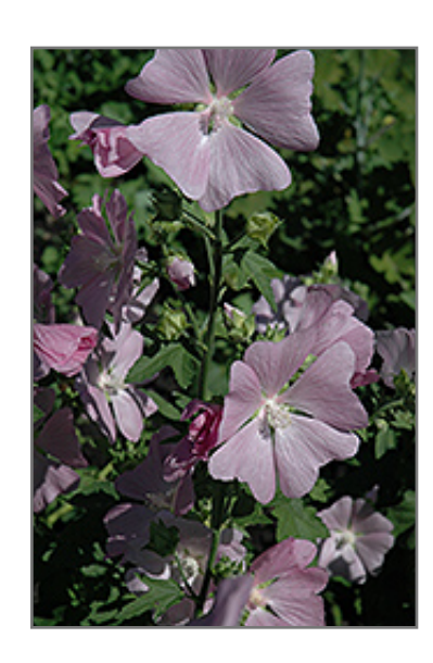
Pink Mallow flowers

Pink Mallow will grow to be about 3 feet tall at maturity, with a spread of 24 inches. It grows at a fast rate, and under ideal conditions can be expected to live for approximately 3 years. As an herbaceous perennial, this plant will usually die back to the crown each winter, and will regrow from the base each spring. Be careful not to disturb the crown in late winter when it may not be readily seen!