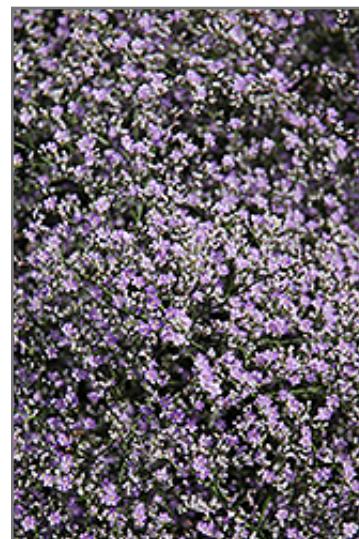
Sea Lavender flowers