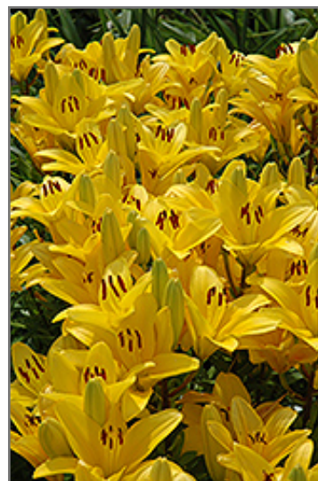
Gironde Lily flowers