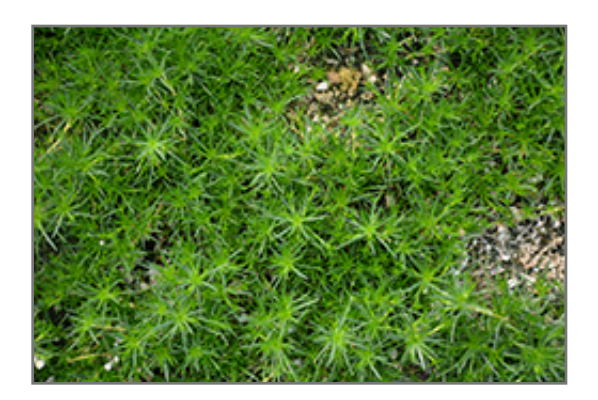
Irish Moss foliage