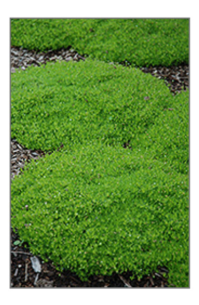
Irish Moss