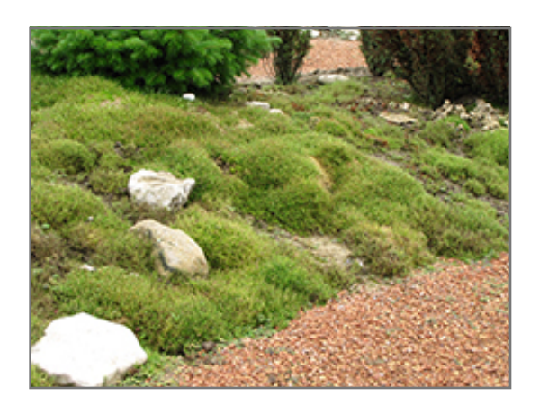
Irish Moss

This plant does best in full sun to partial shade. It does best in average to evenly moist conditions, but will not tolerate standing water. It is not particular as to soil type or pH. It is highly tolerant of urban pollution and will even thrive in inner city environments. Consider covering it with a thick layer of mulch in winter to protect it in exposed locations or colder microclimates. This species is not originally from North America. It can be propagated by division.