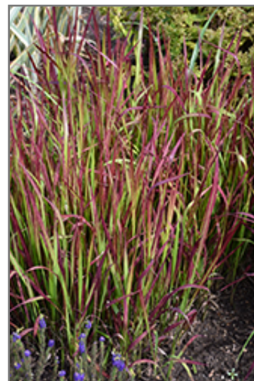
Red Baron Japanese Blood Grass foliage

Red Baron Japanese Blood Grass is recommended for the following landscape applications;