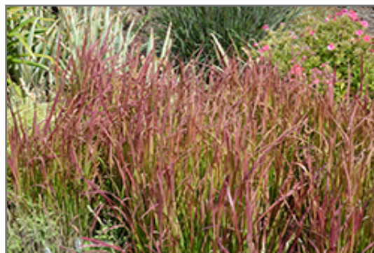
Red Baron Japanese Blood Grass

Red Baron Japanese Blood Grass will grow to be about 20 inches tall at maturity, with a spread of 18 inches. It grows at a slow rate, and under ideal conditions can be expected to live for approximately 20 years. As an herbaceous perennial, this plant will usually die back to the crown each winter, and will regrow from the base each spring. Be careful not to disturb the crown in late winter when it may not be readily seen!