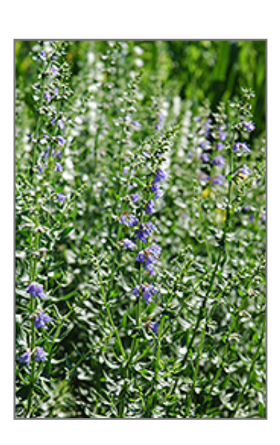
Hyssop flowers

Aside from its primary use as an edible, Hyssop is sutiable for the following landscape applications;