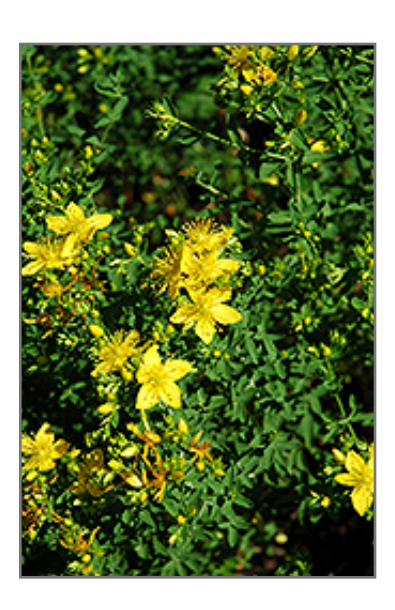
St. John's Wort flowers

This plant does best in full sun to partial shade. It prefers to grow in average to dry locations, and dislikes excessive moisture. It is considered to be drought-tolerant, and thus makes an ideal choice for a low-water garden or xeriscape application. It is not particular as to soil type or pH. It is highly tolerant of urban pollution and will even thrive in inner city environments. This species is not originally from North America.