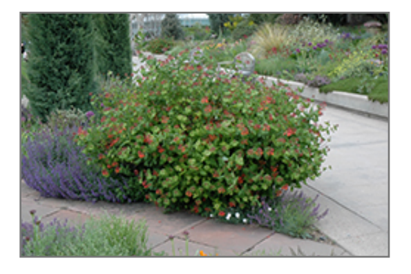
Dropmore Scarlet Trumpet Honeysuckle in bloom