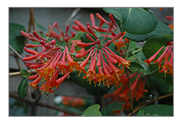
Dropmore Scarlet Trumpet Honeysuckle flowers