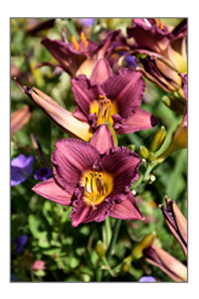
Purple de Oro Daylily flowers

A compact, vigorous and long blooming selection that features ruffled, plum colored flower with bright golden yellow throats; strong, sturdy stems rise above mounds of arching green foliage; an easy to grow variety perfect for beds, borders and containers