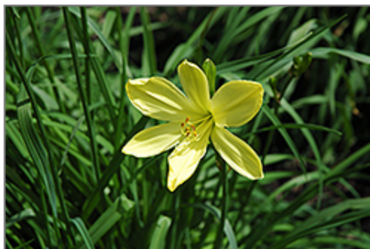
Flavina Daylily flowers