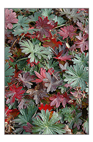
Bloody Cranesbill in fall

Bloody Cranesbill will grow to be about 12 inches tall at maturity, with a spread of 18 inches. When grown in masses or used as a bedding plant, individual plants should be spaced approximately 15 inches apart. Its foliage tends to remain dense right to the ground, not requiring facer plants in front. It grows at a medium rate, and under ideal conditions can be expected to live for approximately 10 years. As an herbaceous perennial, this plant will usually die back to the crown each winter, and will regrow from the base each spring. Be careful not to disturb the crown in late winter when it may not be readily seen!