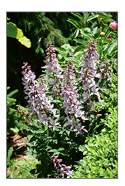
White Gas Plant flowers

This is a relatively low maintenance plant, and is best cleaned up in early spring before it resumes active growth for the season. Deer don't particularly care for this plant and will usually leave it alone in favor of tastier treats. It has no significant negative characteristics.