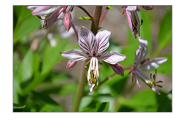
White Gas Plant flowers

White Gas Plant is an herbaceous perennial with an upright spreading habit of growth. Its medium texture blends into the garden, but can always be balanced by a couple of finer or coarser plants for an effective composition.