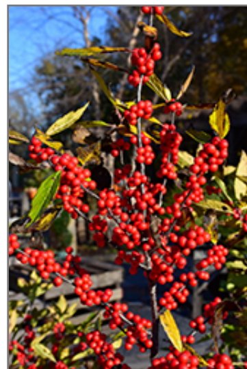
Winterberry fruit

Winterberry is recommended for the following landscape applications;