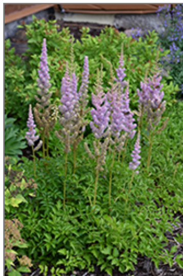
Dwarf Chinese Astilbe in bloom