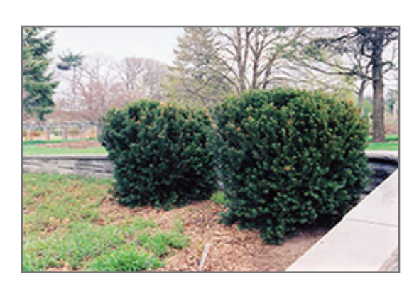
Hill's Yew

A choice evergreen landscape shrub with an upright oval to pyramidal habit, bright green emerging foliage is held against dark evergreen needles in spring; makes a great upright hedge, takes pruning very well; one of the few evergreens that loves shade