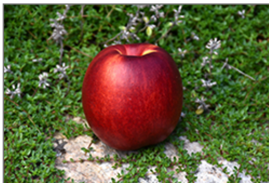
Fantasia Nectarine fruit

Fantasia Nectarine is draped in stunning clusters of fragrant pink flowers along the branches in early spring, which emerge from distinctive rose flower buds before the leaves. It has dark green deciduous foliage. The narrow leaves turn yellow in fall. The fruits are showy yellow drupes with cherry red overtones, which are carried in abundance in late summer. The fruit can be messy if allowed to drop on the lawn or walkways, and may require occasional clean-up.