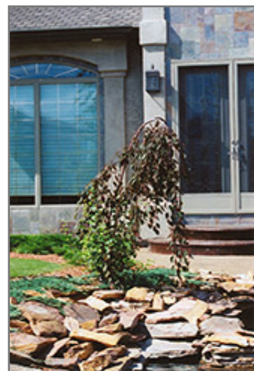
Royal Beauty Flowering Crab