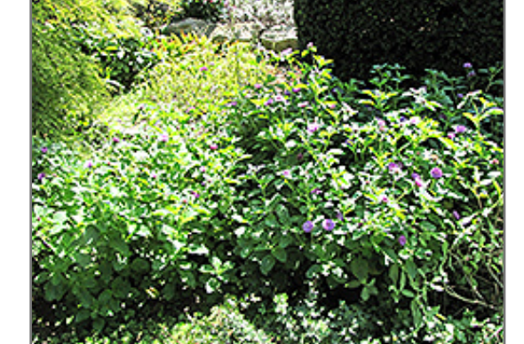
Button Beauty Brazilian Bachelor's Button in bloom

This plant will require occasional maintenance and upkeep, and is best cleaned up in early spring before it resumes active growth for the season. It is a good choice for attracting butterflies to your yard. Gardeners should be aware of the following characteristic(s) that may warrant special consideration;