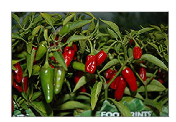
Apache Pepper fruit

This variety produces an upright, sturdy plant with lance shaped green leaves; green fruits progress to red when they mature; yields plenty of medium-hot fruit