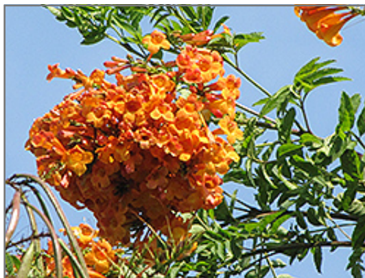
Orange Jubilee Esperanza flowers

Orange Jubilee Esperanza is recommended for the following landscape applications;