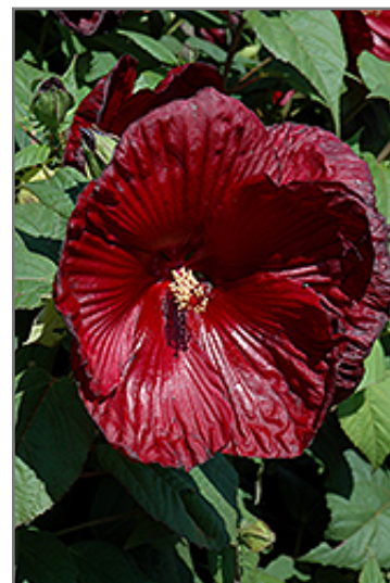
Heartthrob Hibiscus flowers