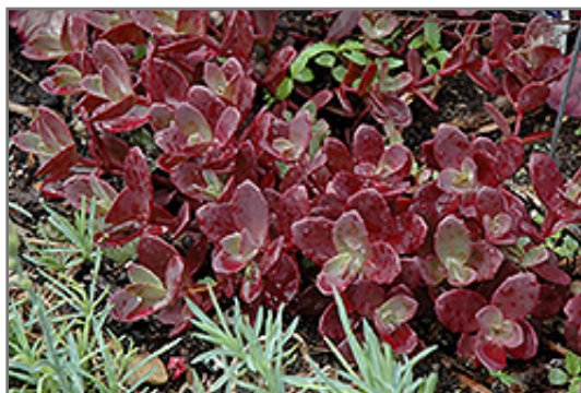
Firecracker Stonecrop foliage

Firecracker Stonecrop is recommended for the following landscape applications;