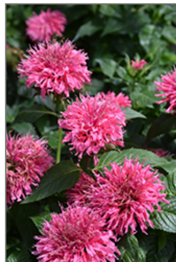
Bubblegum Blast Beebalm flowers