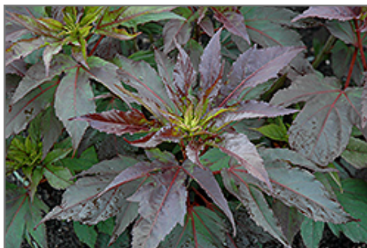
Midnight Marvel Hibiscus foliage

This plant does best in full sun to partial shade. It requires an evenly moist well-drained soil for optimal growth, but will die in standing water. It is not particular as to soil type or pH. It is highly tolerant of urban pollution and will even thrive in inner city environments. Consider applying a thick mulch around the root zone in winter to protect it in exposed locations or colder microclimates. This particular variety is an interspecific hybrid. It can be propagated by cuttings; however, as a cultivated variety, be aware that it may be subject to certain restrictions or prohibitions on propagation.