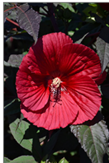
Midnight Marvel Hibiscus flowers