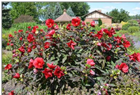
Midnight Marvel Hibiscus in bloom