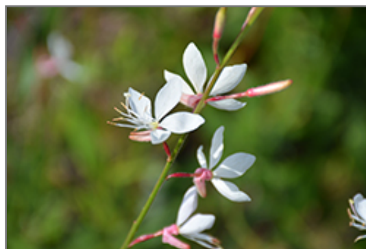
Sparkle White Gaura flowers