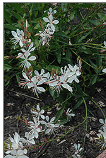
Sparkle White Gaura flowers

Sparkle White Gaura is recommended for the following landscape applications;