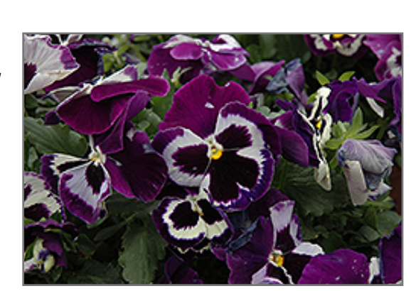
Delta Violet With Face Pansy flowers