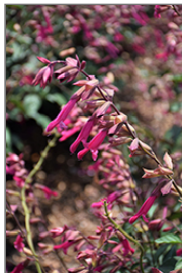
Wendy's Wish Sage flowers

Wendy's Wish Sage is recommended for the following landscape applications;