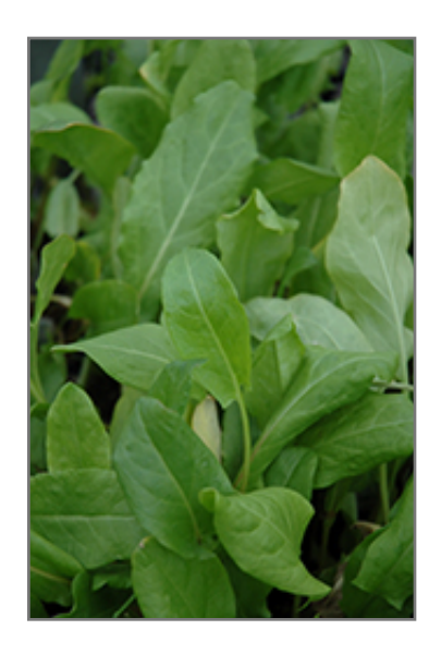
Sorrel foliage

Sorrel's attractive crinkled narrow leaves remain dark green in colour with showy red variegation throughout the season on a plant with a mounded habit of growth. It features subtle spikes of green star-shaped flowers rising above the foliage in early summer.