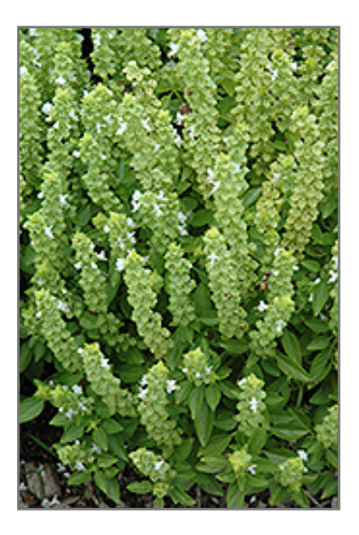
Greek Basil flowers

This plant is quite ornamental as well as edible, and is as much at home in a landscape or flower garden as it is in a designated herb garden. It should only be grown in full sunlight. It prefers to grow in average to moist conditions, and shouldn't be allowed to dry out. It is not particular as to soil type or pH. It is somewhat tolerant of urban pollution. This is a selected variety of a species not originally from North America. It can be propagated by cuttings; however, as a cultivated variety, be aware that it may be subject to certain restrictions or prohibitions on propagation.