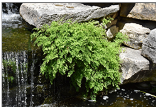
Southern Maidenhair Fern