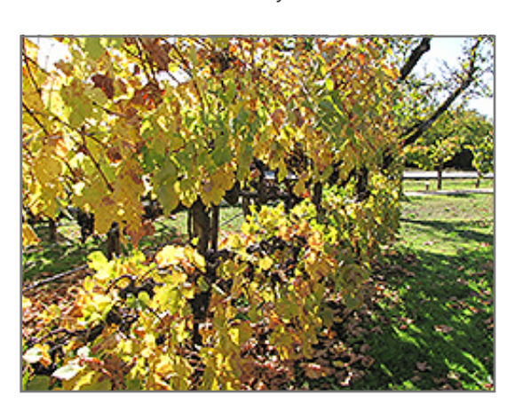
Merlot Grape in fall